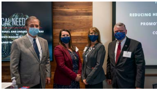
HRSA Deputy Director visits College of Nursing to announce NAS program award launch.

This report is designed to highlight the many scholarship accomplishments of the College of Nursing which is remarkable given the widespread impacts of the pandemic extended to every area of operations, including research and scholarship. Research operations, scholarship, engagement with participants, clinical sites and communities were reimagined in a pandemic and socially-distanced environment. Faculty and staff not only met these challenges, but they also accelerated the pace of research and scholarship.